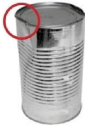
Dented at junction of side and end