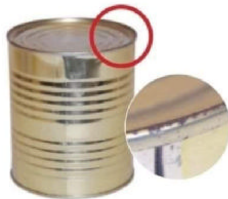
Pitted rust or leaking

Cans with any of these defects may be unsafe. Discard them!