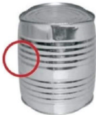
Swollen or bulging