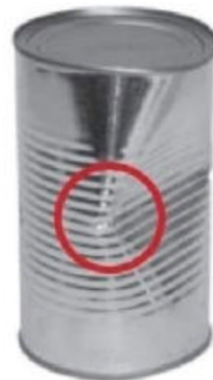
Sharp dent or dent on seam